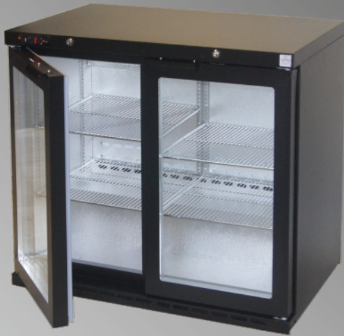
905mm Standard Height Range